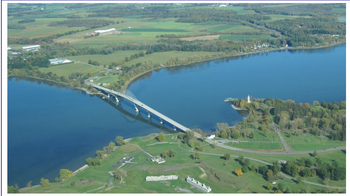
Aerial photo of Crown Point Bridge near Chimney Point, Vermont.